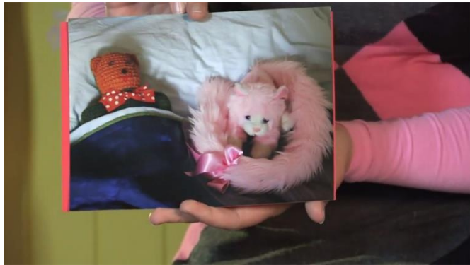
1. Find old magazines or newspapers.