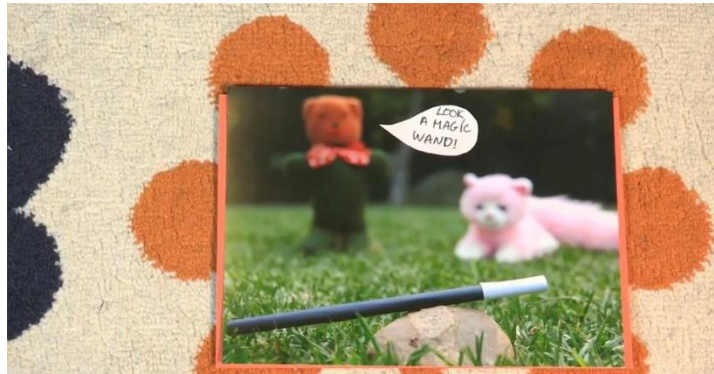
3. Add some words if you like.